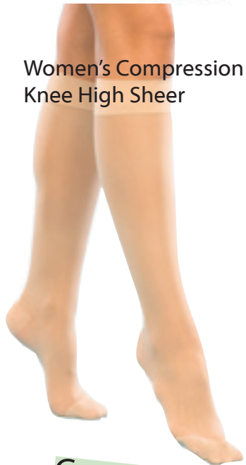
Women's Compression Knee High Sheer