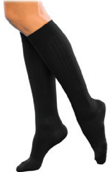
Women's Compression-Dress Sock

Having a healthy diet will help you keep a normal weight thus lowering leg symptoms and swelling.