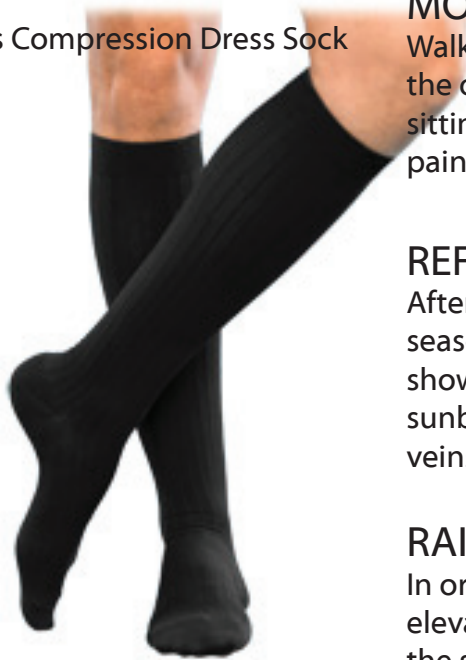
Men's Compression Dress Sock